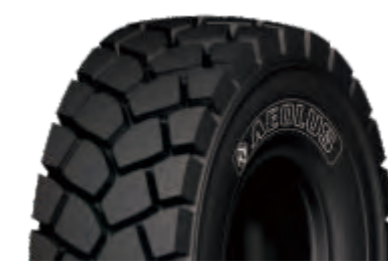
AE37 / E3