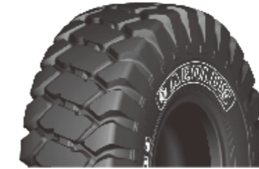
AL369 / L3