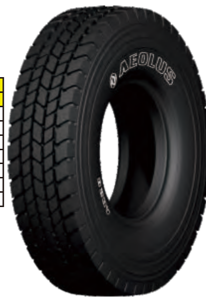
AR28 / E2