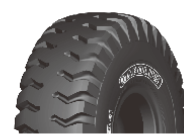
G-34 / E3