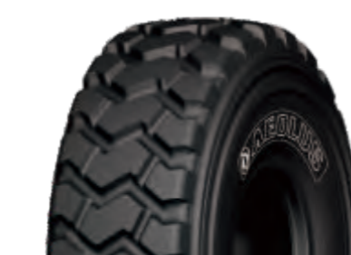
AL37 / E3