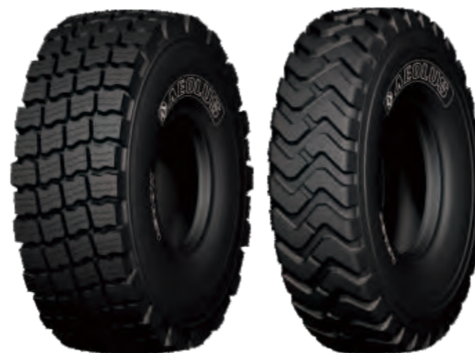
A SNOW / G2