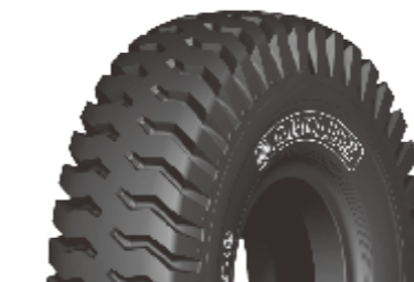
G-4C / E4