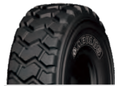
AL37 / L3