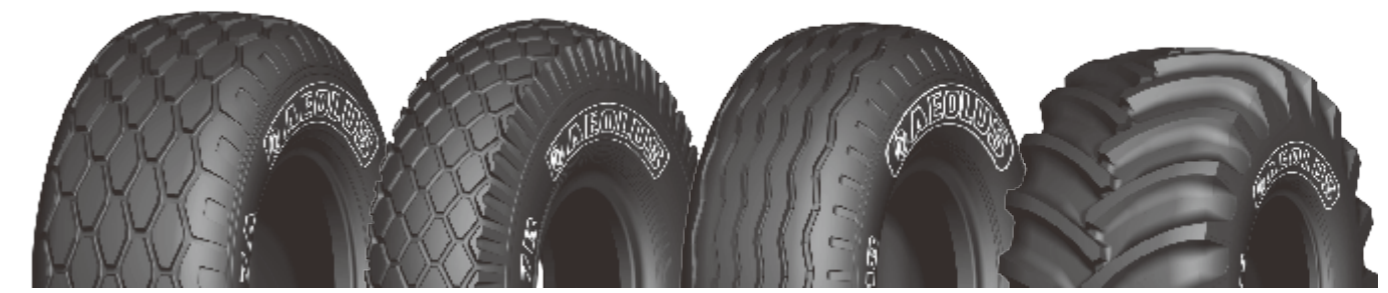
G-7A / E7 G-7B / E7 G-18 / E7 G-19