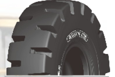
G-24 / L5