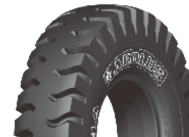
G-4A / E4