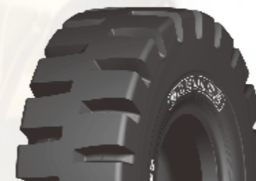
G-25 / L5