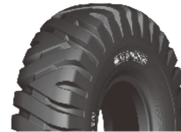
G-10 / E3