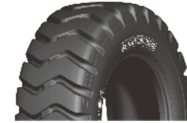
G-12A / L3