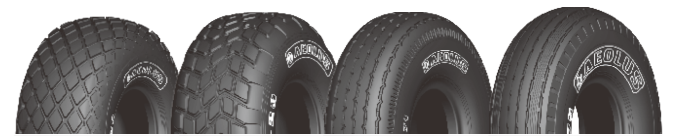
G-20 / E7 G-29 / E7 AE71 / E7 AE75 / E7