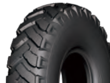
G-9 / L3