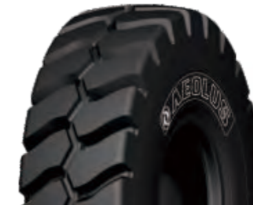
AL59 / L5