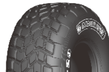
G-29 / E7