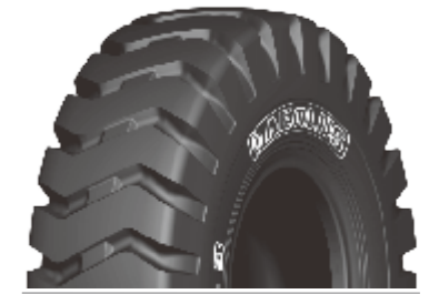
G-3 / L3