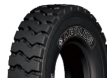
AE35 / E3