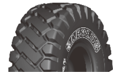
G-26 / L3