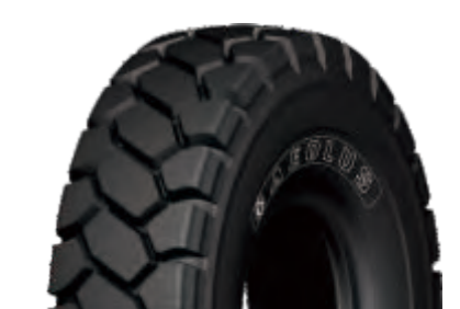
AE45 / E4