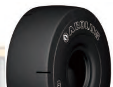
AS50 / L5S