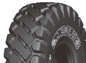
G-26 / E3