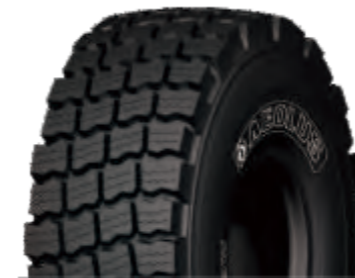
A SNOW / L2