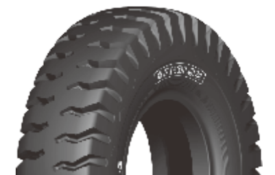
G-4E / E4