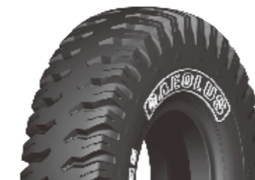
G-35 / E4