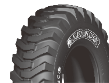
AL216 / L2