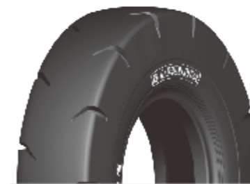
G-2 / L2 / L3