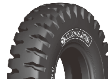
G-31 / E4