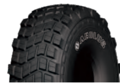
AE77 / E7