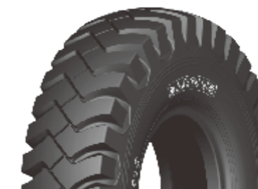
G-11A / E4