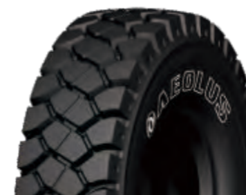
AE46 / E4