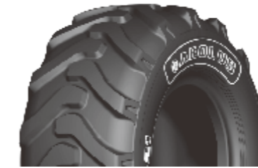
G-21 / L2