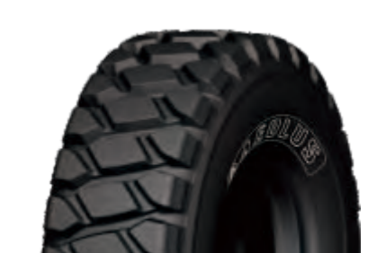
AE48 / E4