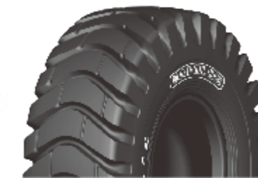
G-14 / L3