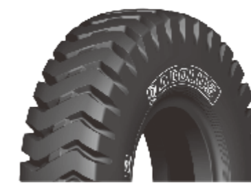
G-12 / E3 / E4