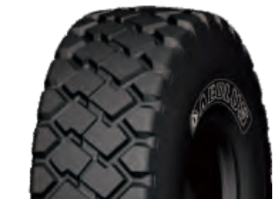
AL36 / E3