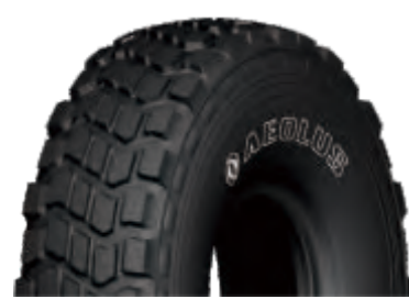
AE73 / E7