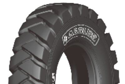
G-6 / E3