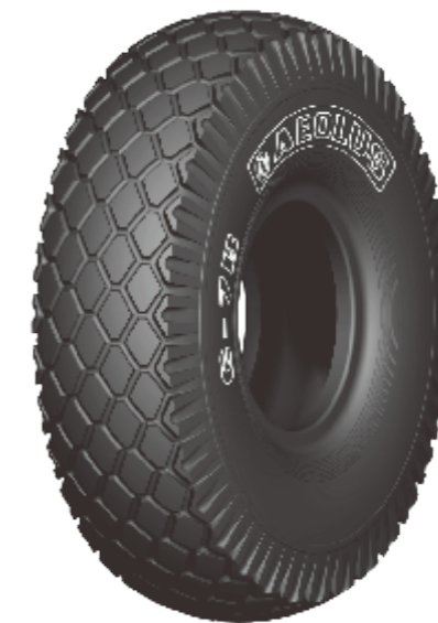
G-7B / E7