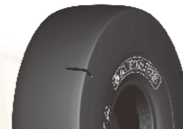
G-1A / L3S