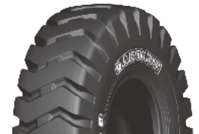
G-3 / L3