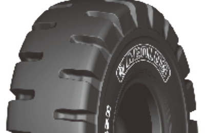
AL458 / L4