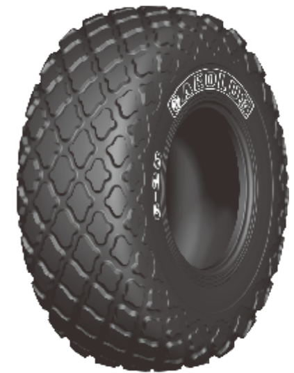
G-23 / E7