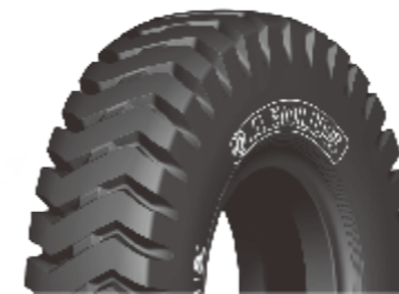
G-12 / L3 / L4