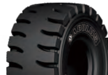
AL53 / L5