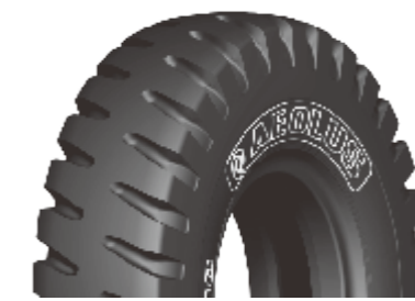
G-30 / E4