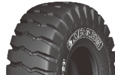
AL368 / L3