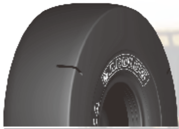
G-1A / L4S / L5S