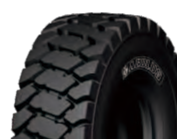
AE49 / E4