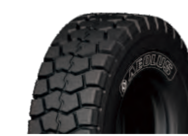
AE33 / E3