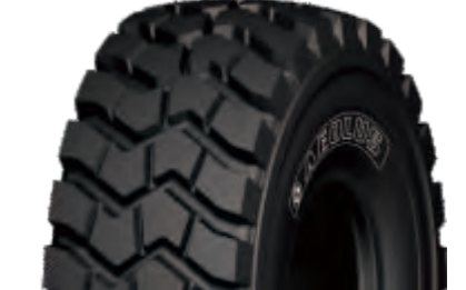
AE39 / E3