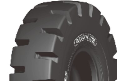
G-24 / L4