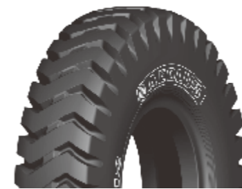
G-12 / E3