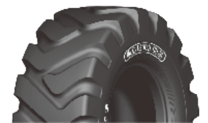
G-16 / L3