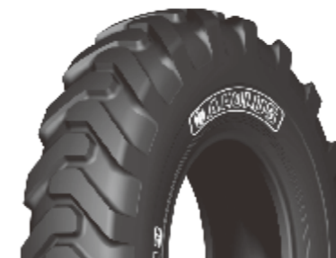
G-13 / L2