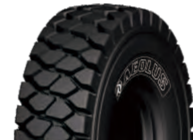
AE43 / E4