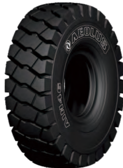
AIN46 / IND4