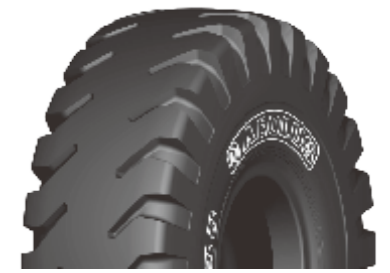
G-33 / L3