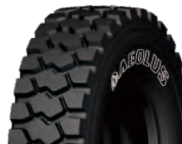
AE41 / E4