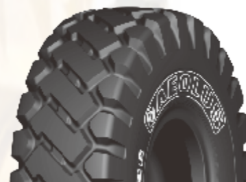
G-26 / L3