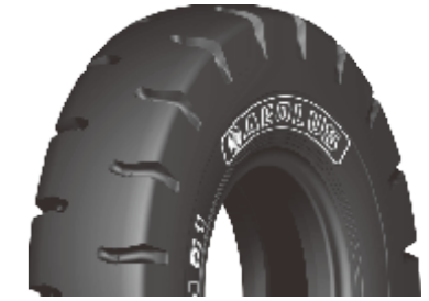
AIN31 / IND-3