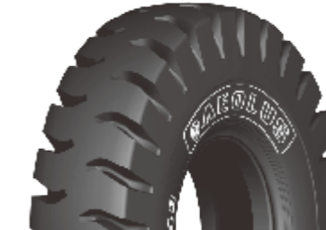
G-4B / E4