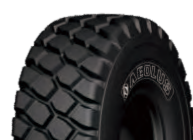
AE47 / E4