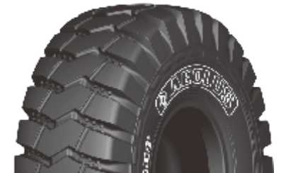
AL388 / L3