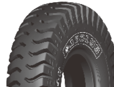
G-4D / E3/E4