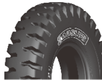
G-31 / E4