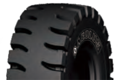
AL55 / L5