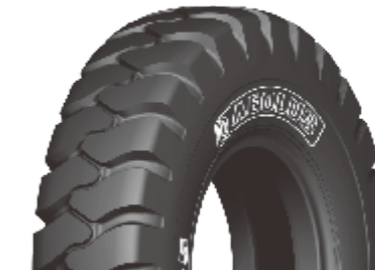
G-5 / E3