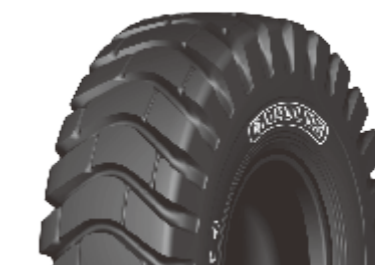
G-14 / L3