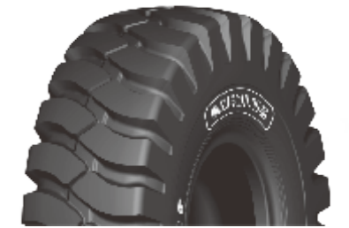
G-15 / L3