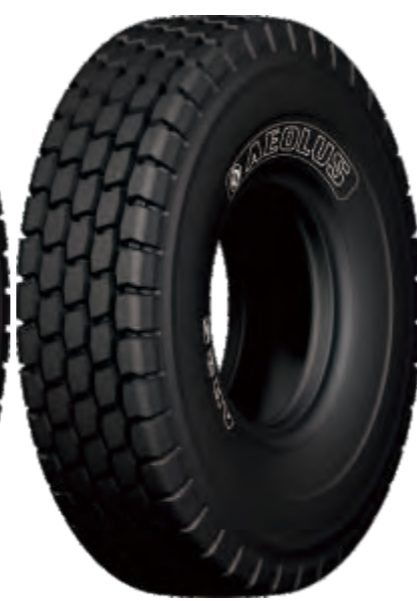
AR25 / E2