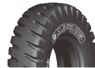
G-30 / E3