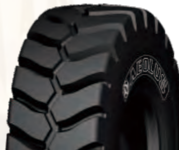
AL58 / L5