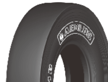
G-1B / C1